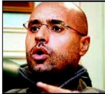
DUBIOUS DOCTORATE: Saif

The LSE in a statement said it is investigating two specific claims against Saif al-Islam, 37, and was aware of allegations that he may have used a ghostwriter for his thesis. "The allegations are in the public domain about possible plagiarism in Saif Gaddafi's PhD thesis," an LSE